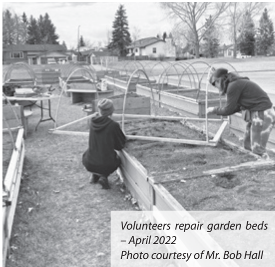
Volunteers repair garden beds – April 2022