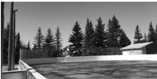
Waiting for ice