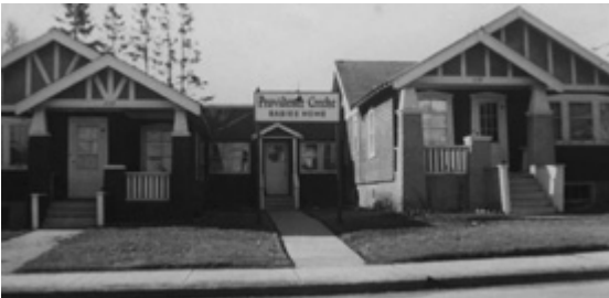
Providence Creche, Calgary, 1943

Please visit www.providencechildren.com/75years/ to share your connection to Providence and learn about all the exciting events that are happening throughout the year—including an Alumni Homecoming September 22nd, 2018. Hope to see you there!