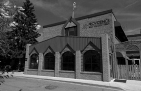
Providence, Calgary, 2018