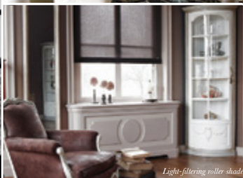
Light-filtering roller shade