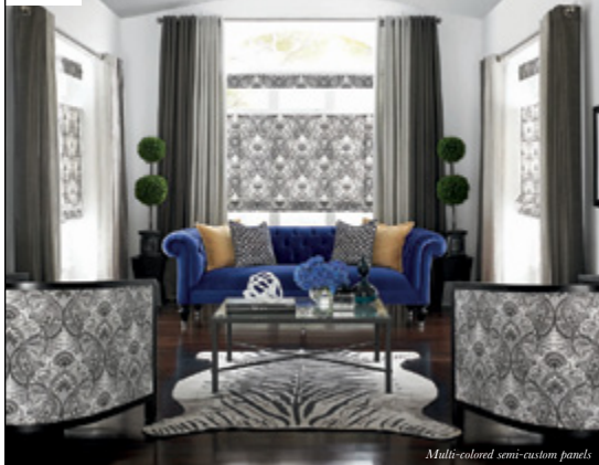
Multi-colored semi-custom panels