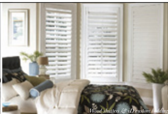
Wood shutters & iD custom blinds